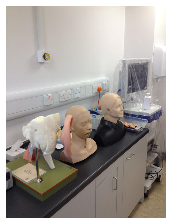
Just one of the new rooms in the facility