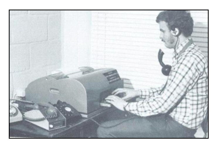
In 1979 the first textphone was developed specifically for deaf communications consisting of a device

It was not until 1973 that the first text telephone calls for deaf people were being made on what were modified telex machines. It took another two years before the first relay service was established and allowed deaf text users to communicate with voice telephone users using an operator based in a Leonard Cheshire home in Amphill in Bedfordshire.