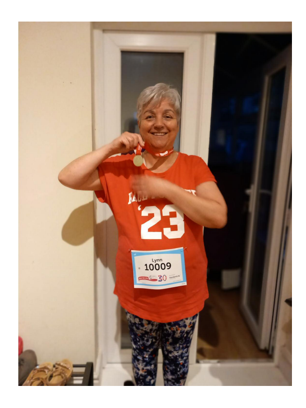
I did it 3k jogging!

"I jogged the majority of the course, and going up hills I fast walked, (not quite got the hang of jogging up hill yet but I will), then the last 1k I ran to the finish line just over 19 minutes. Yeah."